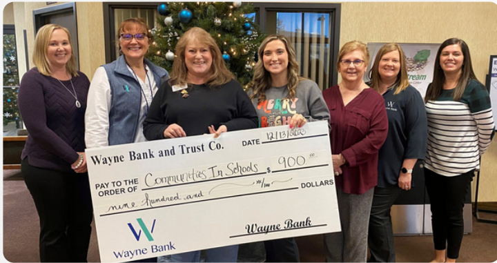
Wayne Bank and Trust Company

and projects that will serve to prosper the area for decades and beyond. In 2023 the bank donated over $100,000 toward targeted local initiatives and nonprofits that address local issues such as education, poverty, physical and mental health, and more. On any given day, staff can be found volunteering with nonprofits, rubbing shoulders with local businesses and entrepreneurs, and supporting their neighbors with kindness and generosity.