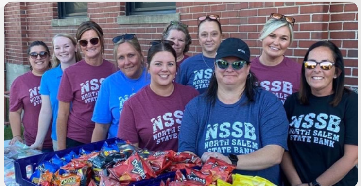
North Salem State Bank

For 100 years North Salem State Bank has consistently embedded itself into the communities it serves and emphasizes its mission through the tagline, "Where Caring Still Counts." In 2023 the bank proudly gave more than $500,000 by way of sponsorships and donated over $120,000 to charitable initiatives, with bank employees contributing more than 6,000 volunteer hours. In celebration of its 100th year in business, the bank made special monthly charitable contributions to organizations throughout its footprint deemed crucial for community betterment, such as fairgrounds, police departments, community foundations and more. North Salem State Bank believes that banking is not just about financial transactions but is about being deeply woven into the fabric of the community.