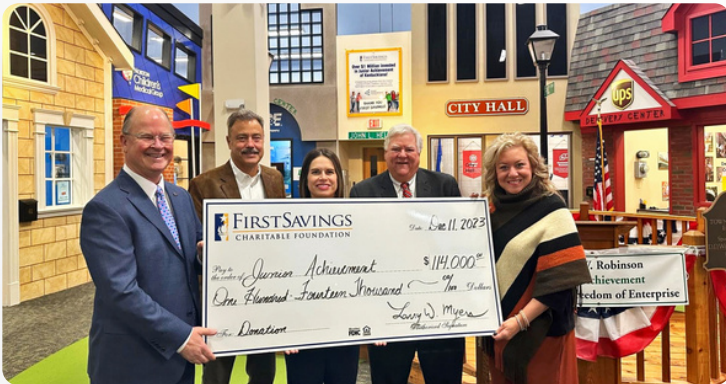
First Savings Bank

On Giving Tuesday each year, employees choose 10 nonprofits in Hancock County to receive a monetary donation. The bank prides itself on its continued efforts in the community to support organizations and individuals that help the community thrive. Overall, the bank does not measure its success by dollars or volunteer hours, but by the impact it makes on the overall quality of life in the community.