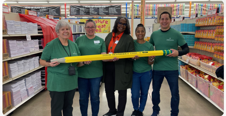
The National Bank of Indianapolis

volunteer events, as well as serve organizations that mean the most to them personally. In 2023, 137 employees volunteered 3,242 hours to 113 local nonprofit organizations.