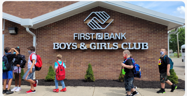
First Bank Richmond

First Bank Richmond is committed to being an integral partner to the communities it serves. The bank has identified four key areas of need in its community: education, financial literacy, physical & mental health, and the fostering of local nonprofit organizations and their initiatives. In 2023 the bank proudly donated nearly $675,000 to nonprofit organizations and 50% of staff served on nonprofit boards and committees. The bank cultivates a culture of service internally through volunteerism during operating hours, ongoing training and development in areas of interest, and various incentives. For 137 years, First Bank Richmond has told the story of banking story through its commitment to fostering a flourishing community of physically, mentally and fiscally sound members.