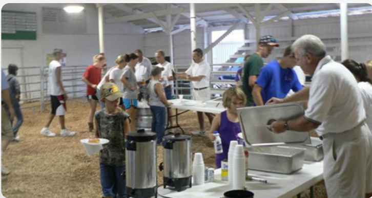
First Harrison Bank

First Harrison Bank's philosophy has always been, "If the communities we serve grow and thrive, we will grow and thrive along with them." The bank supports over 200 organizations in the community each year with financial support, time and talent. In 2023 the bank was recognized with the Business First Partners in Philanthropy Award, taking home fourth place for a medium-size business in the Louisville metro area. One of the bank's longest-running community efforts is serving breakfast to 4-H members and their families during fair week, which the bank has done every year since 2003. The bank has taken pride in being looked to as a community leader since its inception in 1891.