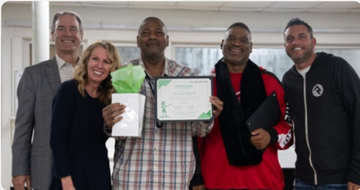
Merchants Bank of Indiana

Through time, talent and treasure, Merchants Bank of Indiana aims to carry on a tradition of banking excellence. The bank particularly focuses on affordable housing advancement, providing access to critical grant funds and financial education, and more. This includes dedicated community partnerships with Intend Indiana, the Federal Home Loan Bank of Indianapolis and more to support the community at large by providing more affordable options and increasing financial autonomy for low-income families and individuals. Bank staff work with organizations such as accessABILITY Indiana and other community development organizations to offer financial literacy training. Whether through big monetary donations or small acts of kindness, giving back serves as a constant reminder of the people who make Merchants Bank of Indiana possible.