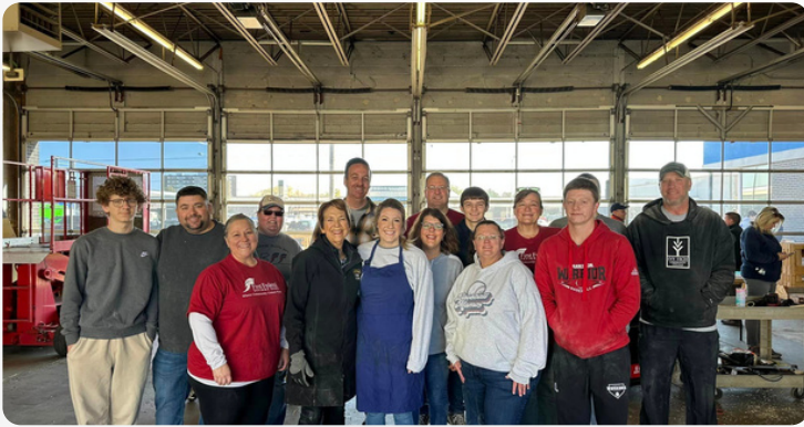
First Federal Savings Bank