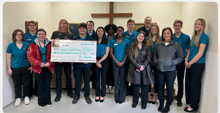
Logansport Savings Bank

At Logansport Savings Bank, being a community bank means that it gives time, talent and financial support to both its customers and local communities. In 2023, the bank gave over $60,000 in charitable contributions and donations that supported dozens of local schools, student athletes, kids and families, and various nonprofit organizations across multiple counties in north central Indiana. Outreach efforts include participation and volunteerism by more than 30 employees in and around the communities that the bank serves. The bank believes that banking is built on relationships, and the story of banking shines through when people see, know and trust their local bank as a community supporter.