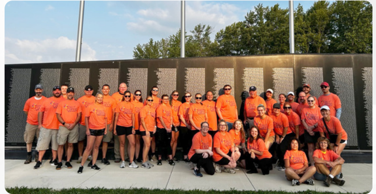
STAR Financial Bank

STAR Bank is deeply committed to being good neighbors and supporting its communities in central and northeast Indiana by investing time and money in volunteer help and financial aid. Specifically, the bank's philanthropy is focused on education, arts and economic development, with about 80% of the bank's charitable giving falling within those pillars. In 2023 the bank committed more than $400,000 to over 80 organizations across its footprint. Employees are given eight hours of paid volunteer time per year to serve at local organizations in need; 111 employees volunteered over 645 hours to various area organizations in 2023. The bank operates on the core belief of "Growing by Serving," both corporately and at an individual level.