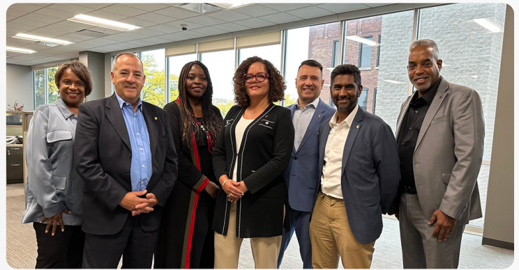
First Merchants Bank

financial wellness; community home lending; and diversity, equity and inclusion. In 2023 alone, the bank donated over $1.2 million. Eight dedicated and paid community service hours allow employees to engage with the community, whether it's volunteering at an event, representing the bank at a fundraiser or delivering financial literacy workshops. The bank believes that by bridging the gap to financial wellness, it empowers individuals, businesses, families and entire neighborhoods to prosper.