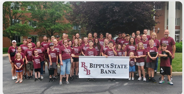
Bippus State Bank

Bippus State Bank measures its outreach by the impact it makes on the community. Giving back to the community is more than just giving out donations – it's also about providing activities and opportunities to the community that they may not have without volunteers. The bank aims to give employees as many opportunities as possible to get involved, including during work hours, on the weekends and during the evening to ensure everyone has some opportunity to volunteer. Bippus State Bank believes it is vital to show the community that the bank stands with them and is here to support them.