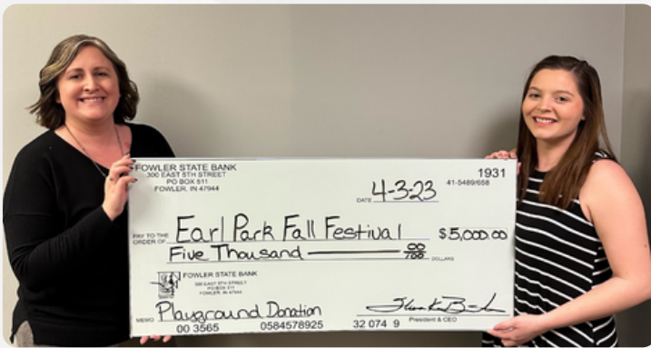
Fowler State Bank

Fowler State Bank serves the three most sparsely populated counties in Indiana and considers the communities it serves to be like family. If someone needs help, all hands are on deck at the bank. From making donations to local 4-H programs and food pantries to volunteering at the local movie theater, the bank seeks to support the community at large, whether those who benefit are customers or not. Several staff members volunteer on various boards, and even more are involved in local organizations such as Rotary, Benton Community Foundation, Earl Park Fall Festival Foundation, Fair/4-H Board and more. Above all, the bank strives to uphold its motto: "Community Owned. Community Grown. Community Focused."