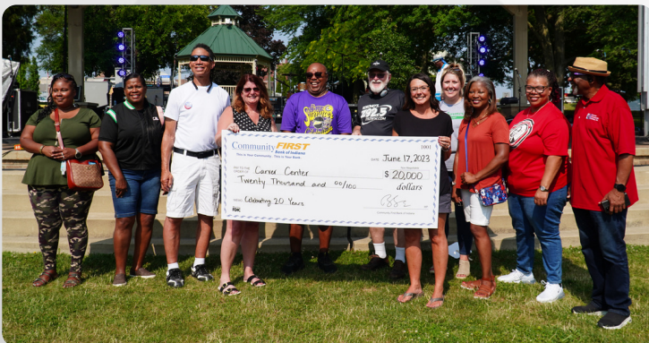
Community First Bank of Indiana

Community First Bank of Indiana celebrated two decades of business and community impact in 2023. The bank donated over $138,000 to 106 nonprofits, sponsored 70 local events and had 62% employee participation, racking up over 900 hours of volunteer time. To celebrate its 20th anniversary, the bank donated $20,000 to the Carver Community Center and featured nonprofits that are 20-year partners in a billboard campaign. The bank also officially marked the milestone of $1 million donated as of November 2023. Internally, the bank offers several programs and incentives to encourage volunteerism. Simply put, community was the reason for the bank's founding 20 years ago and remains at the center of all it does today.